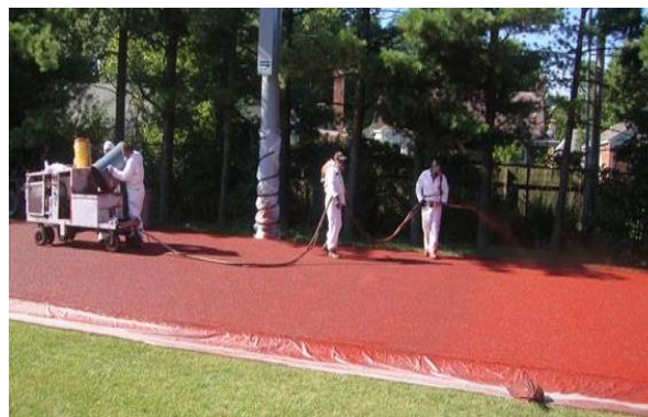
Relaying of Track – Surface Layer