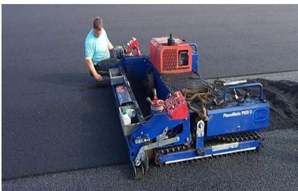
Relaying of Track – Base Rubber