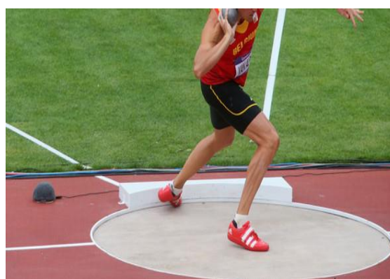
Renewal of Field Event Facilities