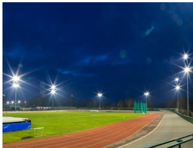
Improved Floodlighting System