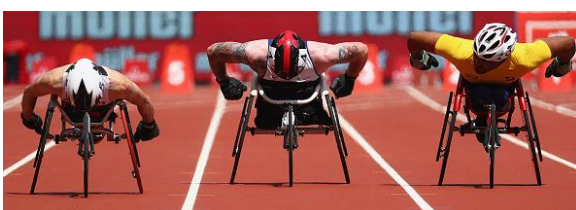
Improved Access for Disabled Athletes